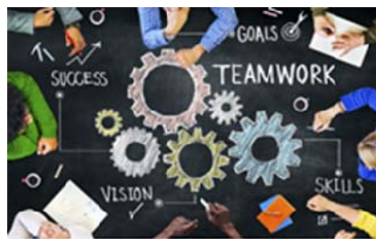
STATEMENT OF ASPIRATIONAL PRACTICE FOR INSTITUTIONAL RESEARCH 2016

In the report, the authors call for activating data-informed student, faculty, and staff decision making through an expanded definition of decision makers and supporting a decision-making process by activating a networked institutional research function. The authors also discuss new leadership responsibilities within the traditional Institutional Research structure and provide an image of a student-focused paradigm.